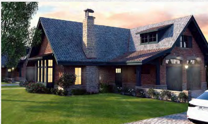
An artist rendering of a condominium concept for Leasure Farms.

Planned giving through MCCF isn't just about making a donation; it's about building a legacy, ensuring your values and passions shape a brighter Muskingum County.