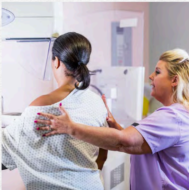
Free mammograms are just one of the programs supported with unrestricted funding.

It's that flexibility that allows us to truly respond to what Muskingum County needs, right when it needs it, and to plant seeds for a brighter future we may not even see coming yet. Consider making an unrestricted gift or opening an unrestricted fund this year.