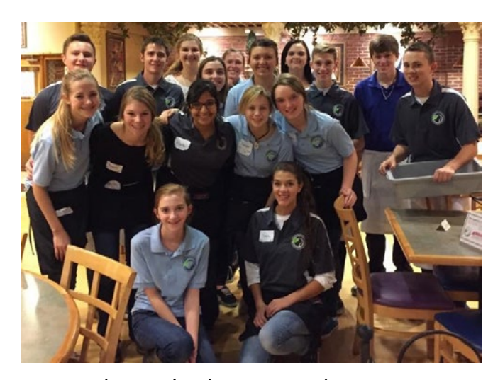
CYF Adornetto's Take-Over Fundraiser 2014