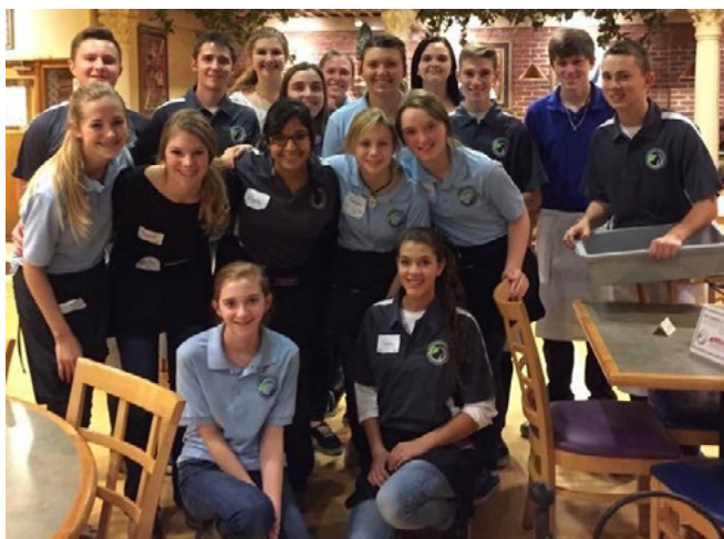
CYF Adornetto's Take-Over Fundraiser 2014